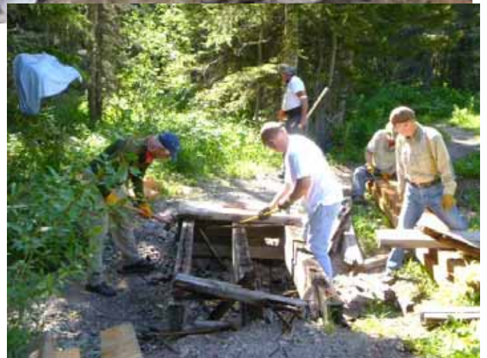
Before and After—the Park Service Model