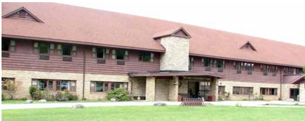
Spatial living at Blackwater Lodge