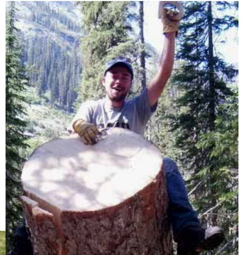
The blow-down had big diameters.