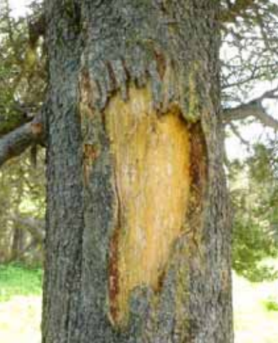
Plenty of Bear Warning Sign